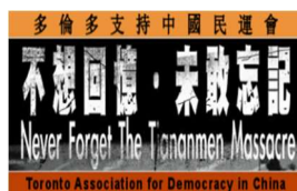
Toronto Association for Democracy in China 多倫多支持中國民主 運動