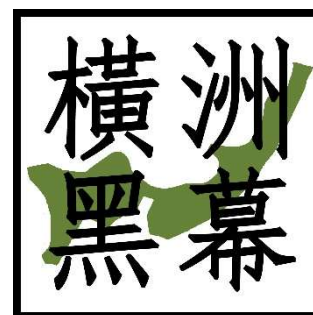
Wang Chau Green Belt Concern Group