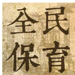
Save Hong Kong Heritages 全民保育行動