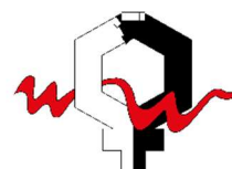
香港婦女勞工協會 Hong Kong Women Workers' Association Hong Kong Women Workers' Association 香港婦女勞工協會